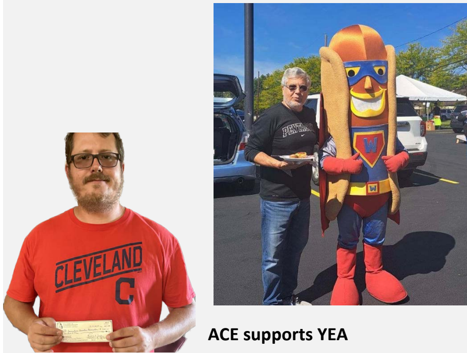
ACE supports YEA

On Saturday, September 16, we had a beautiful day for a tailgate and football game. We had a great turn out and the Penguins won against Robert Morris 48 – 28. Go Penguins!